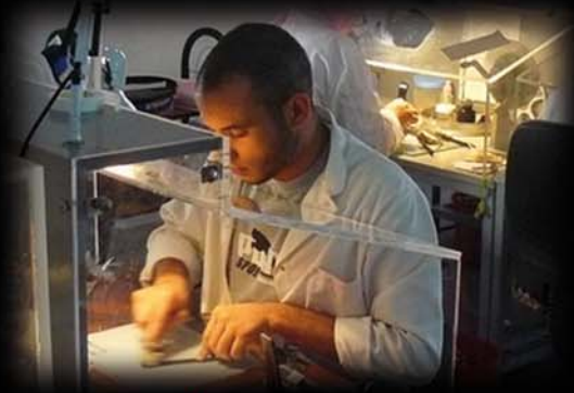
Manual film cleaning