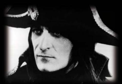
Mastering of "Napoléon " Abel Gance (1927) done by Vectracom for the Cinémathèque Française