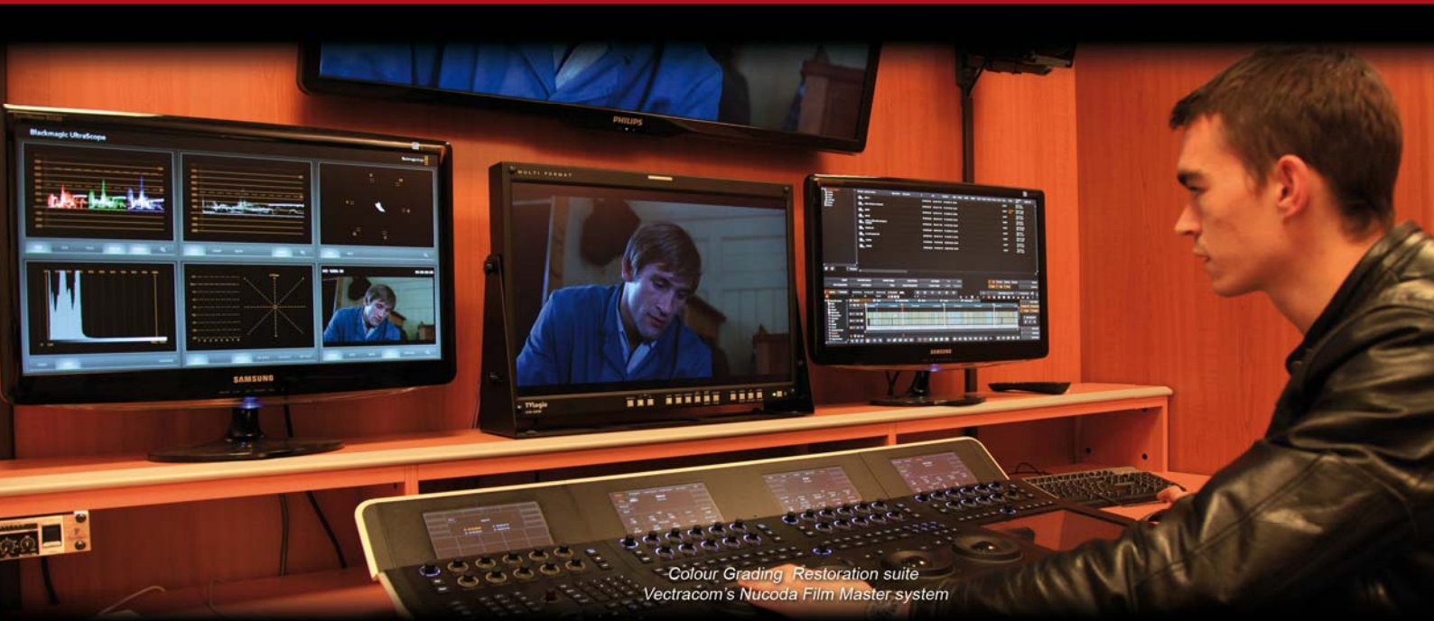
Colour Grading Restoration suite Vectracom's Nucoda Film Master system

The emergence of HD and new broadcasting specifications has created new demands. To meet these new high standards, archive must imperatively undergo a